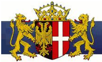
Neuss am Rhein